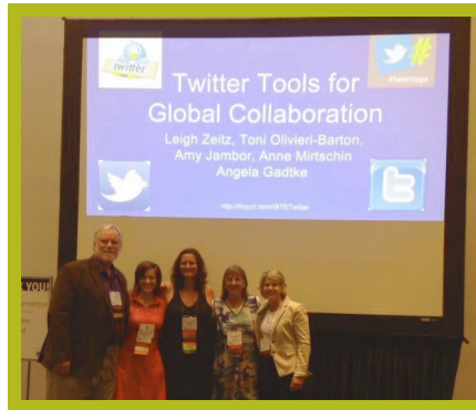
Presenters at ISTE Twitter Tools for Global Collaboration